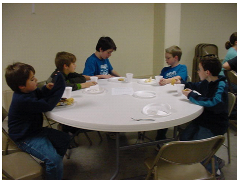
Family Night, Wed. Evening, Jan. 10