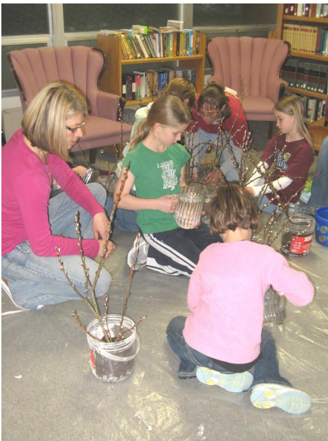
Wednesday Evening Faith Adventure class prepares plants for the MCC sale