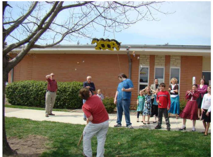
Children enjoy a piñata at the Fiesta Fundraiser March 22