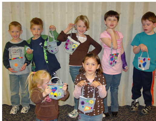
Faith Friends show off the pockets they decorated for the MCC Sale