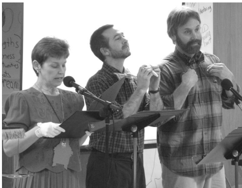
Pastors present their annual reports in a unique and refreshing way!