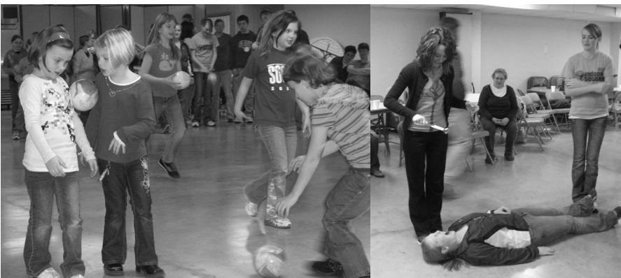
Wednesday Evening Family Fun Night in January. A good time for all!