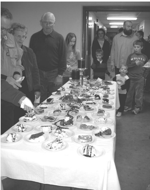
A mouthwatering dessert bar to benefit the Mennonite College TASK Force was enjoyed at our annual meeting.

Redesigned print newsletter, the Washington Memo . Subscriptions are available for $10/year, with a free one-year trial for new subscribers - see http://washingtonmemo.org/washington-memonewsletter/ .