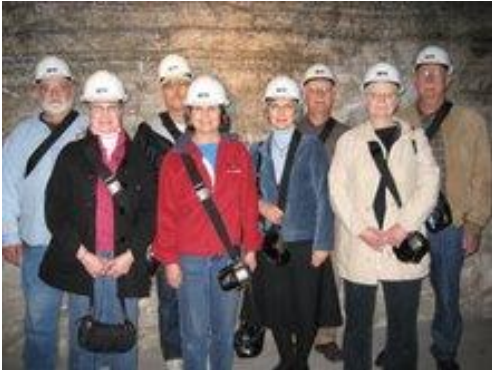
Down, down, down into the deep darkness . . . small group puts their hard hats together to find the salt of the earth.