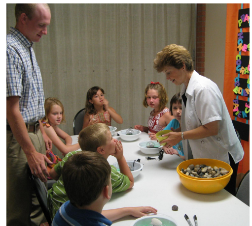
Children learn Stories of God's People