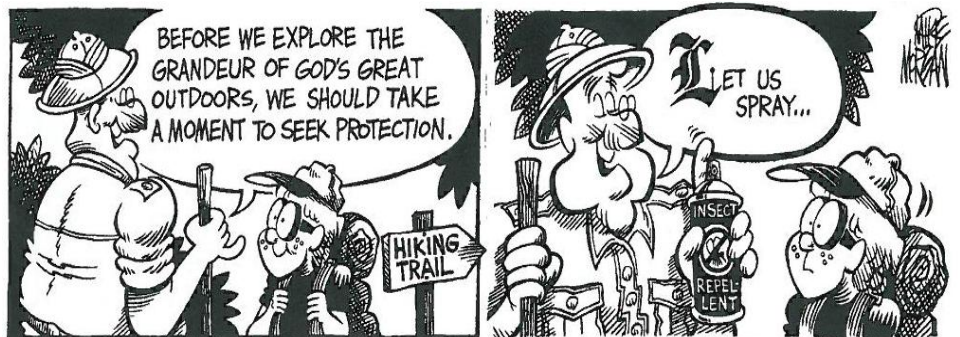
from The Joyful Noiseletter

The serving of great burgers and the fixin's will begin at 5:30pm and live music will follow into the evening. Bring your lawn chairs, some bug spray, and some friends who might just need to become a part of our welcoming congregation! In case of rain, we'll meet in the church basement.