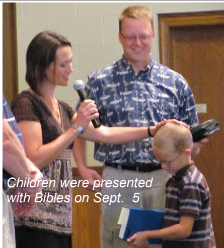
Children were presented with Bibles on Sept. 5