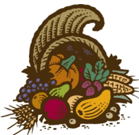
Counting Our Blessings