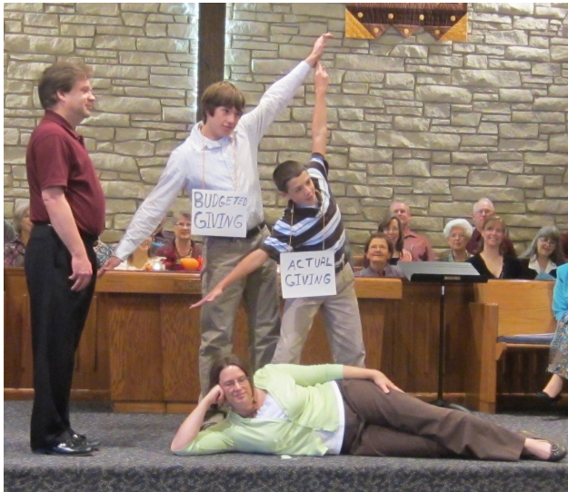
Almost there!! Thank you for your generosity.

Contributions needed by November 30 to meet budget: 2,405.78.