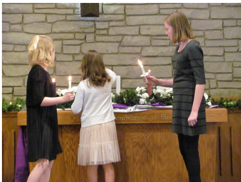
Third Sunday in Advent