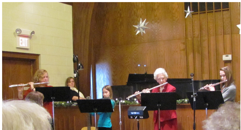
Flute Quartet - December 26 Worship