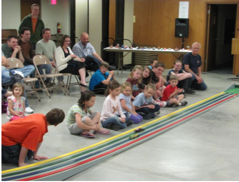
Annual pine car derby - April 6