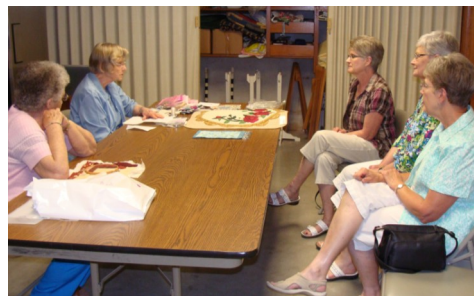
Willing Helpers Mentor Evening