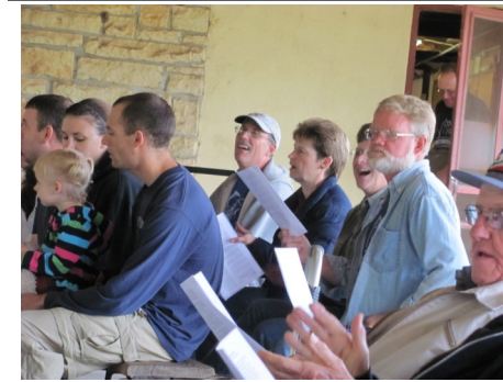
Sunday Worship at Camp MennoScah