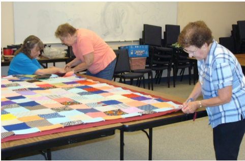
Willing Helpers work at MCC Center