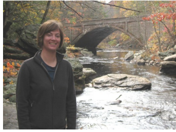
Along the Natchaug River in Connecticut from a train trip to visit family.